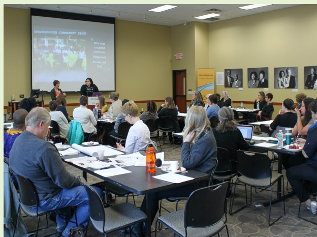
More than 50 people attended the Engaged Learning Series event on May 13, 2015.