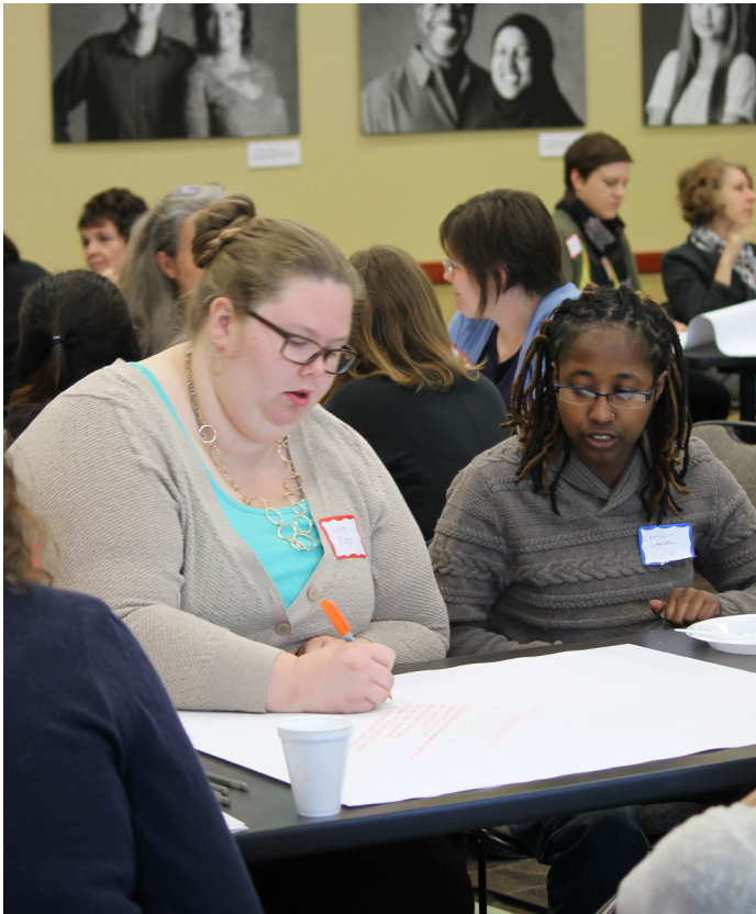
Participants capture their table's discussion on evaluation and community engagement.

A lack of participant power to drive change may also indicate that the organization's community engagement activities could be improved. The Building the Field initiative's assessment tool found at www.buildthefield.org can serve as a resource to determine whether an organization's work is meeting the basic standards of community engagement, including building in ways for community members to be a part of project and organizational decision-making.