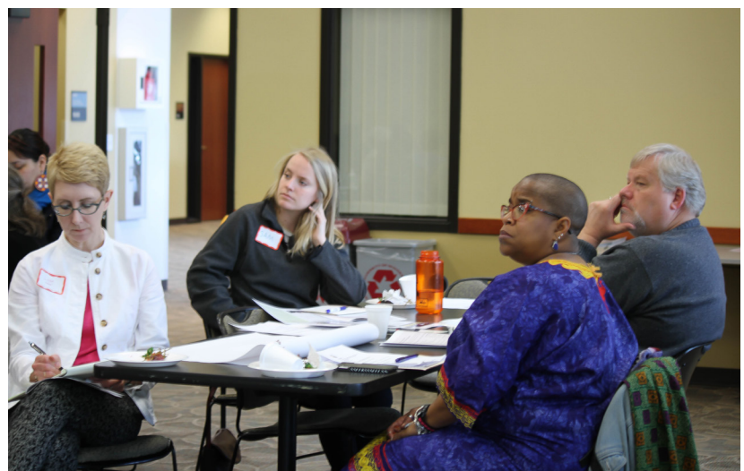
Participants at the Engaged Learning Series event on May 13, 2015.

The questions asked and the outcomes defined in an evaluation have a powerful influence on the outcomes an organization achieves. Community engagement evaluation creates processes for many people in a community to bring their experience, knowledge and dreams to shape the evaluation and, thus, the outcomes of the work. A best practice of community engagement is to involve community members in shaping and leading evaluation.