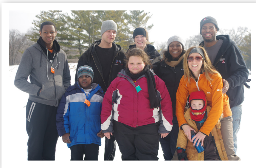
Urban Homeworks’ staff and families at a tubing event at Theodore Wirth Park

Nexus also encouraged Urban Homeworks to shift its partnerships in order to build more trusting relationships with community-based organizations representing people of color. Urban Homeworks began to strategically strengthen its partnerships with other North Minneapolis-based organizations. The organization noticed a turning point in its partnerships when a tornado caused severe damage to historically African American North Minneapolis neighborhoods in 2011. Urban Homeworks stepped up to lead the cleanup efforts in partnership with other Northside groups, demonstrating strong trust and respect among the partners.