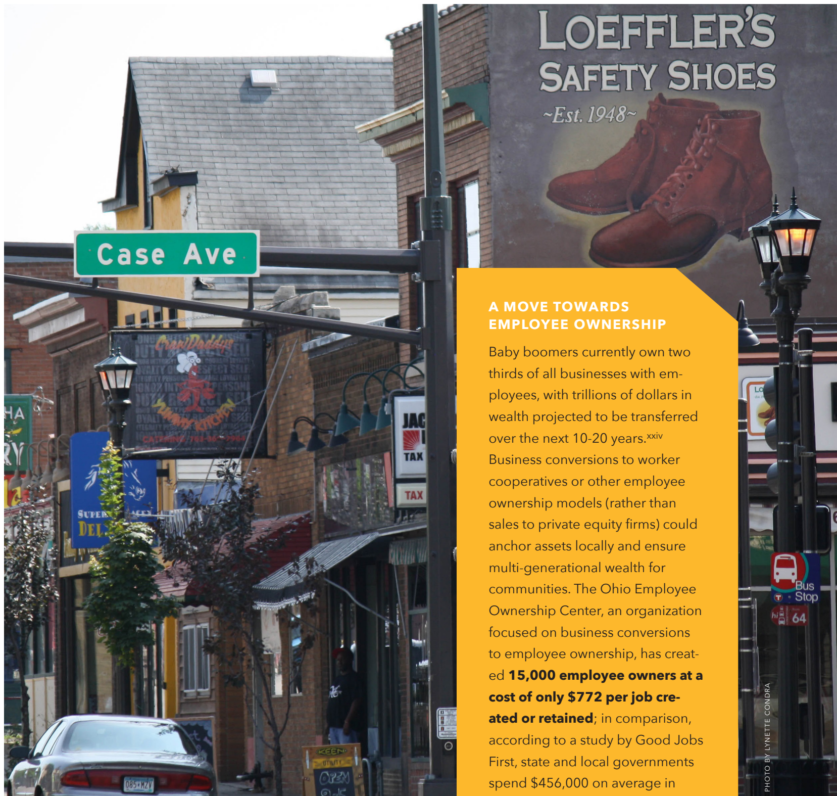
Businesses at the corner of Payne and Case in St Paul's East Side.